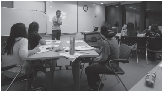
Minna no Nihongo Brush-up Course The Japan Foundation, Manila April 15 to May 29, 2019