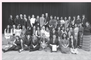
20190227 修了式 A job well done. A lasting friendship.

A graduate of Bachelor of Science in International Studies major in Japanese Language and Studies of the Mindanao Kokusai Daigaku (MKD). Has been working as Japanese instructor for 3 years at the MKD.