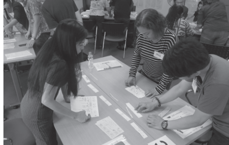
Practice Teaching Course in Manila The Japan Foundation, Manila March 23, 24 and 30, 2019