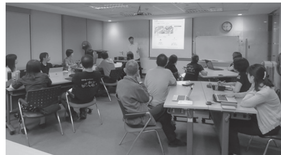
Japanese Education Corpus Tool Seminar The Japan Foundation, Manila March 25, 2019