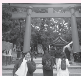
Last day trip to Kansai, Fushimi Inari Shrine