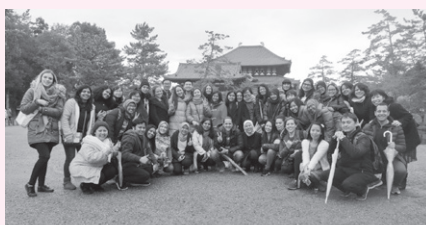
Trip to Kansai