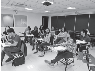
Practice Teaching Course in Alabang PAD Foundation, Muntinlupa City January 11 and 12, 2019