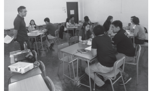
Japanese Education Workshop in Davao Mindanao Kokusai Daigaku (MKD), Angliongto Ave., Lanang, Davao City January 19 and 20, 2019