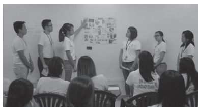
A class in session: comparison of Love between the Philippines and Japan.

The training for the 11th batch ended on May 21 and a total of 308 candidates worked hard to complete the course.